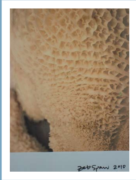
“Tripe-tych” (detail) – Laser print on canvas