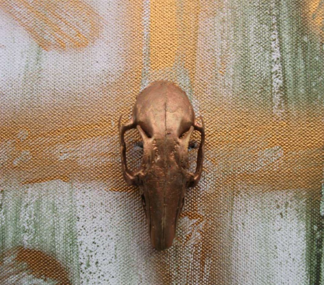
"Crucified" (detail) – Rabbit skull and oil on canvas